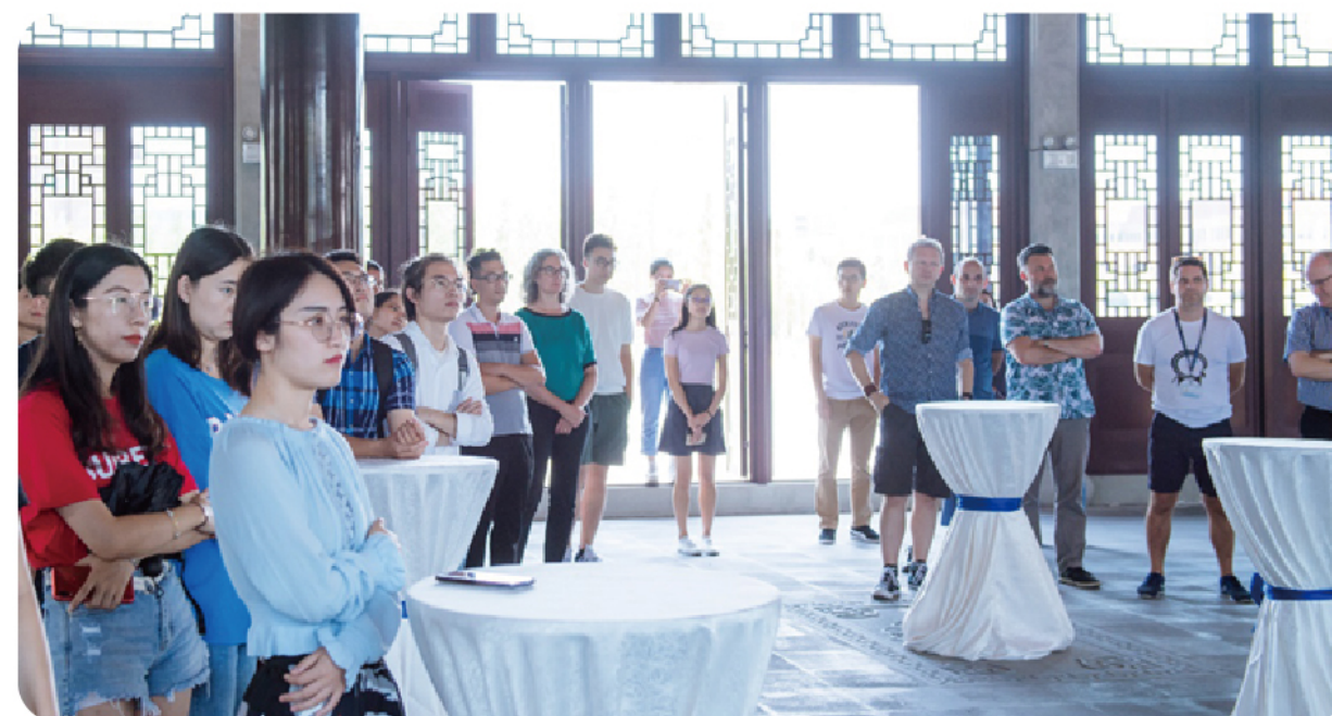
2019级博士研究生欢迎会 / 2019 cohort of dual award PhD students welcome party

ZJE started recruitment of dual award PhD student in 2018. As of December, 2019, 27 domestic students and 5 international students are enrolled in the programme. All the curriculum plan including courses and research training is supported both by ZJE and partner University of Edinburgh, with the marks of collaborative courses recorded in both systems.