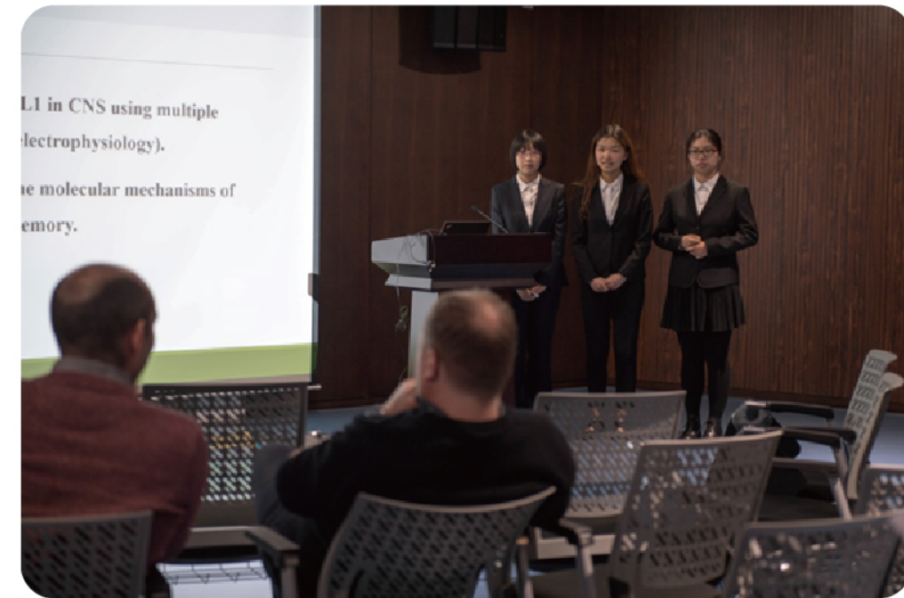
第22期浙江大学SRTP立项答辩 (22nd SRTP Proposal Review)

In 2019 ZJU 22nd SRTP (Student Research Training Program), ZJE students obtained 1 national-level project, 2 provincial-level projects, 3 school-level projects and 11 institute-level projects. 85.7% of the 2017 cohort students participated in SRTP.