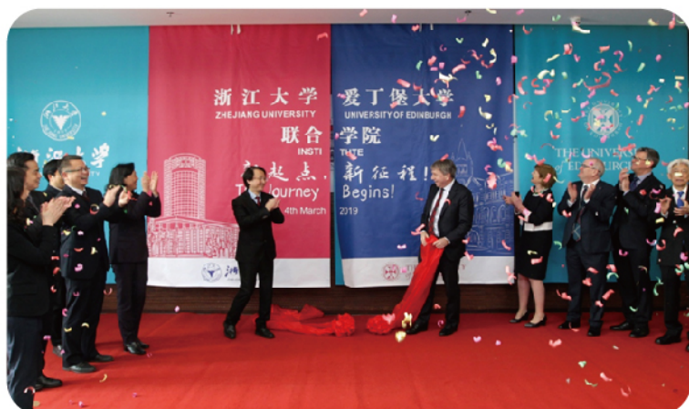
大楼启动仪式/Opening Ceremony of ZJE