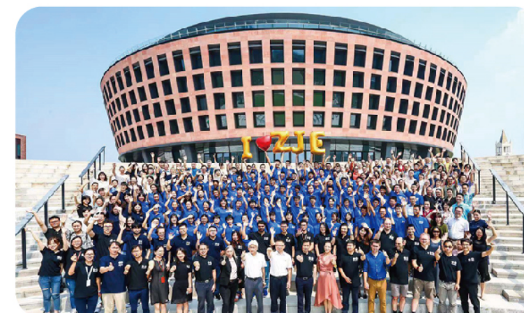
2019开学典礼/2019 New Student Welcome Ceremony