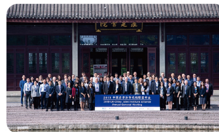
2019中英合作办学机构联盟年会/2019 UK-China Joint Institute Alliance Annual General Meeting

On 15 July, 2019, the 5th Summer Camp for Future Biomedical Asian Scientists and the first ZJE Outstanding Undergraduate Students' Summer Camp were launched. ZJE summer camps are held to inspire more young students' yearning and love for life science, and to discover more future leaders of biomedicine. ZJE summer camps attracted more than 100 excellent students from 40 top high schools and 10 top universities.